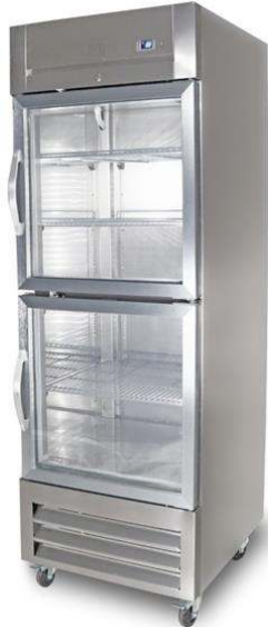
738317 (KCHRI27R2HGDR) 2-Half Glass Door Full Height Refrigerator 27" Long